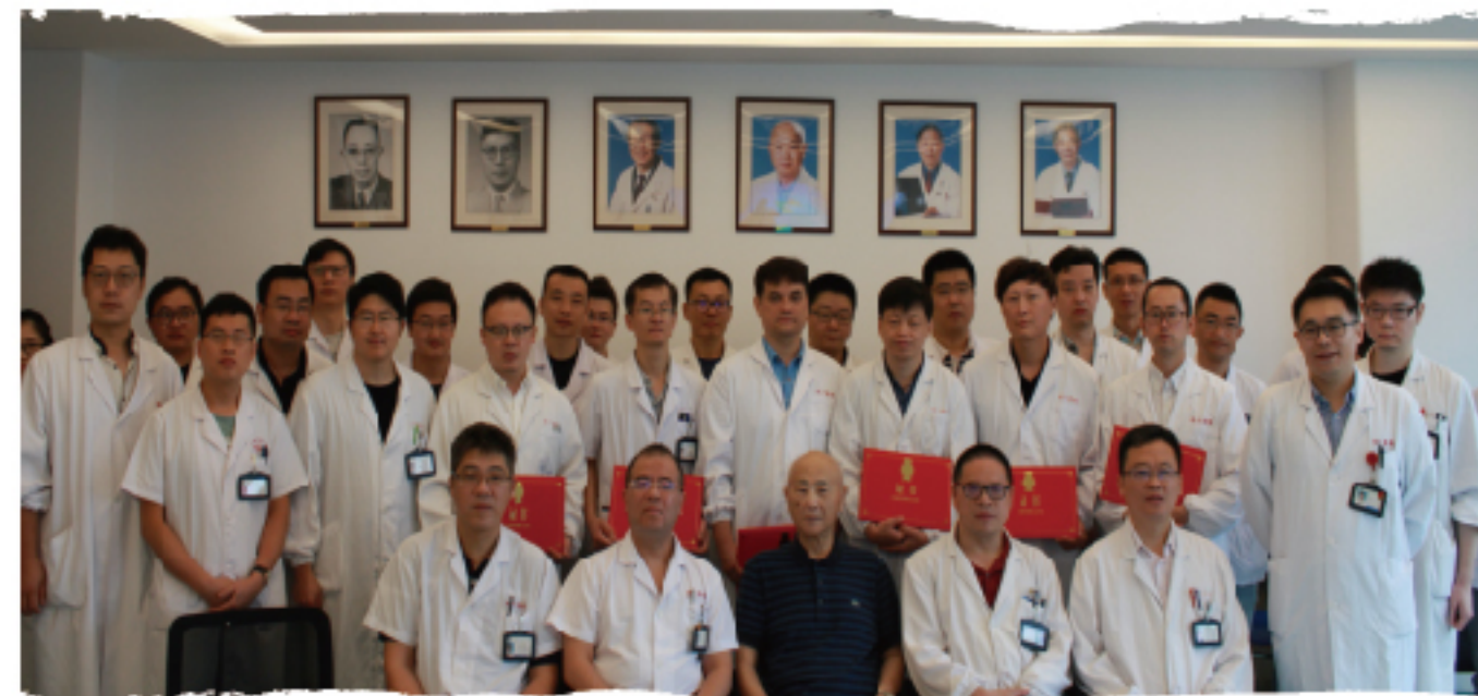
Group photo of the 2 nd session