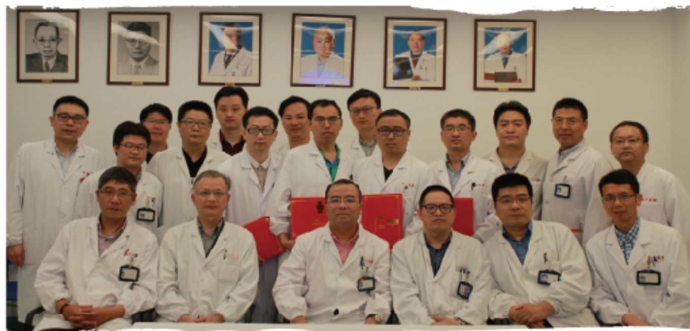
Group photo of the 1 st session